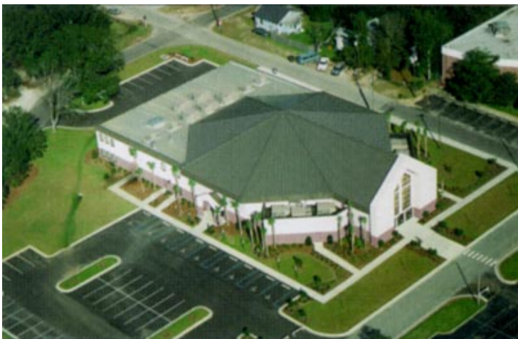
Get the details. The Brownsville Assembly of God Church in Pensacola, FL is a custom-engineered metal building that was designed by Star Building Systems using a knowledge-based detailing system based on Design++ technology from Design Power.